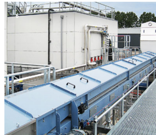
1 Co-digestion of manure, energy crops and rye, Kleinbautzen (Germany) / 2 Sewage sludge digestion, Brest (Belarus) / 3 Wet mechanical feedstock preparation with pulper, Madrid (Spain) / 4 Automatic crane system of feedstock bunker of anaerobic digestion plant, Helsinki (Finland) / 5 STRABAG vacuum discharge system of LARAN® dry digester, Helsinki (Finland) / 6 Feeding system of digester for bio waste, Alphen a. d. Rijn (Netherlands)